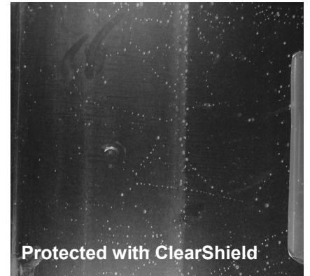
Accelerated limescale build-up through submersion in very hard water